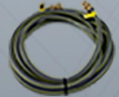
Inlet Refill Hose