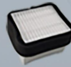
HEPA Air Filter